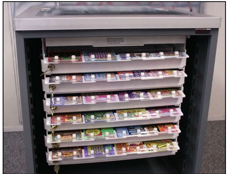
View from the clerk side