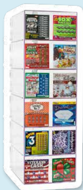
OCSC 12 Game