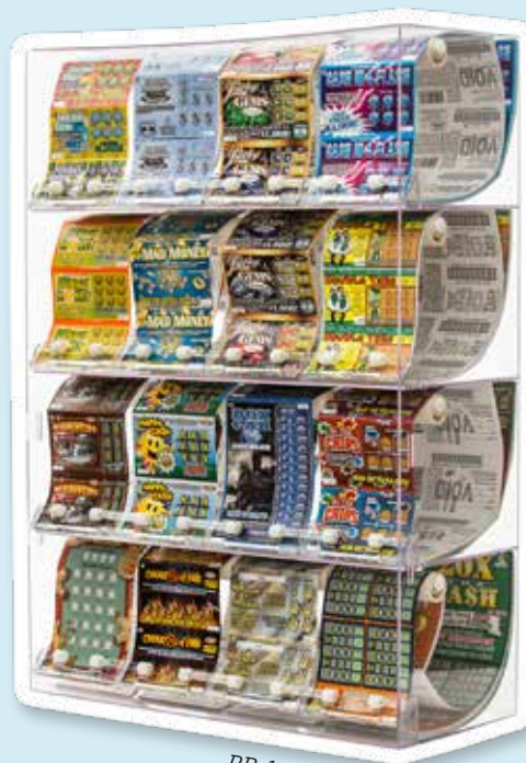
BB-16 16 Game