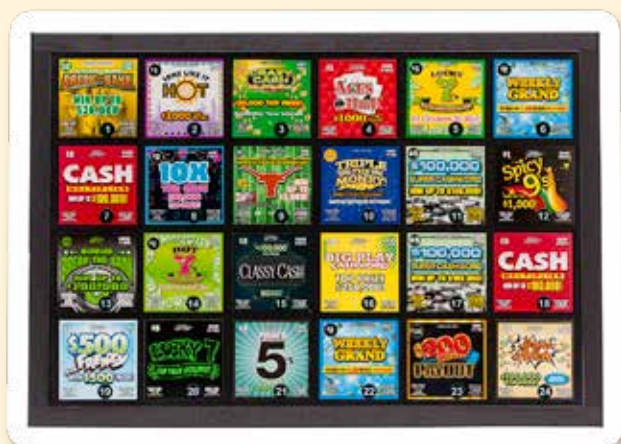
Change Mat 24

Our super thin, durable change mat displays up to 24 games on the counter right at the point-of-sale.