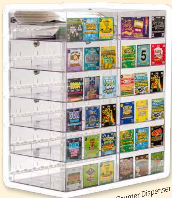
OCTX On-Counter Dispenser

The OCTX dispenses 8" and 12" Super Tickets and 4" tickets from the same bin, allowing you to add oversize tickets and increase facings without adding more bins.