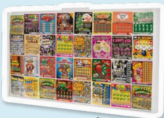
32 Game Menu Board