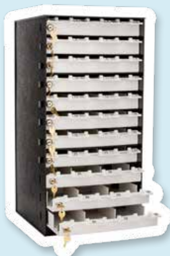
DD 33 Game Remote Base On-Counter