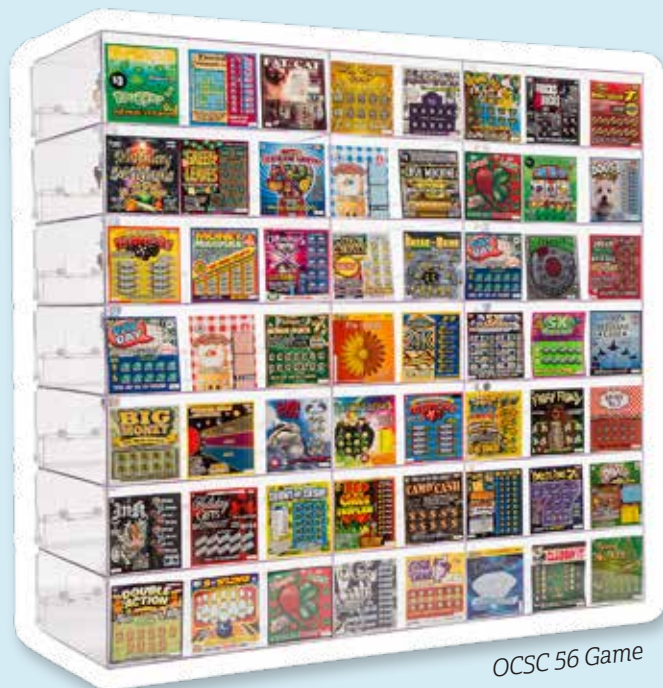
OCSC 56 Game

The most versatile, user-friendly on-counter dispenser in the market