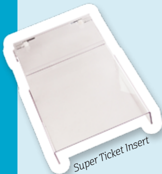
Super Ticket Insert