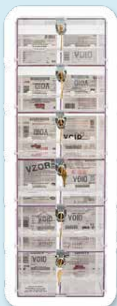
OCSC 12 Game