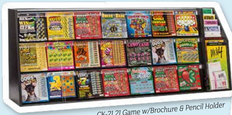
CK-21 21 Game w/Brochure & Pencil Holder

Customizable menu displays meet your specific needs