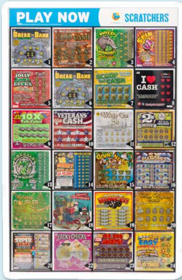
OCCA-24 24 Game

Secure on-counter dispenser with removable front panel