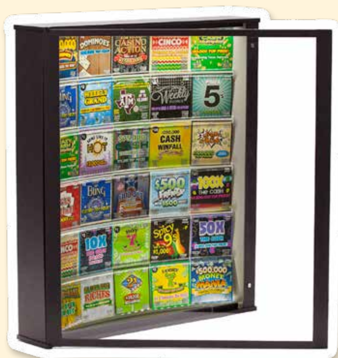
Curved Lighted Menu Board

This bright, sturdy, eye-catching display with magnetized door lets retailers easily update game inserts or sample tickets