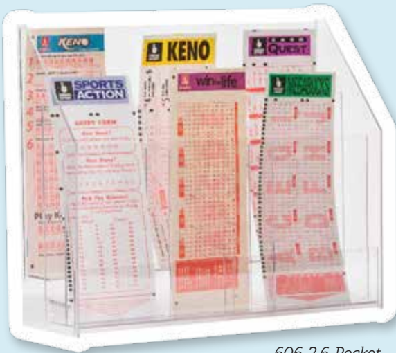
606-2 6-Pocket 608-2 8-Pocket also available