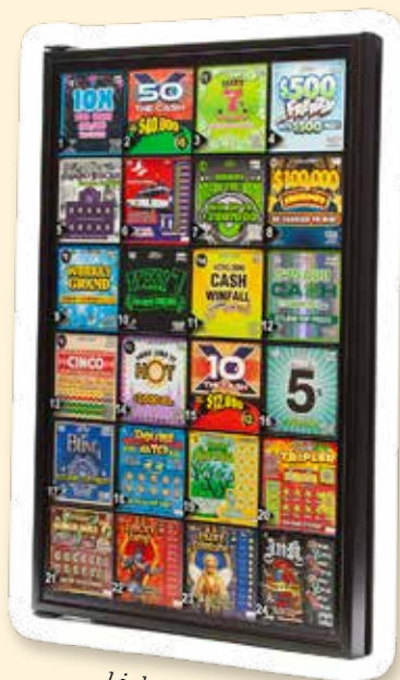
Lighted Poster Display