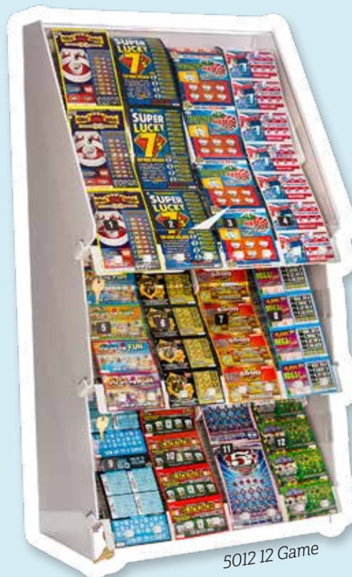
5012 12 Game