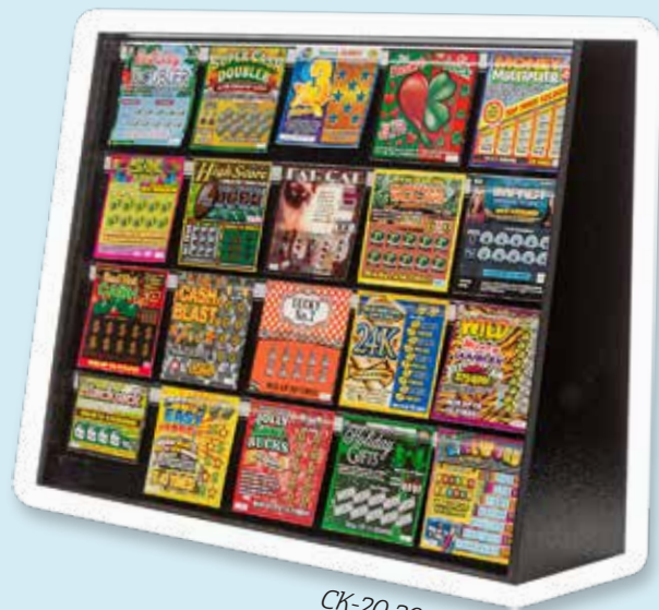
CK-20 20 Game