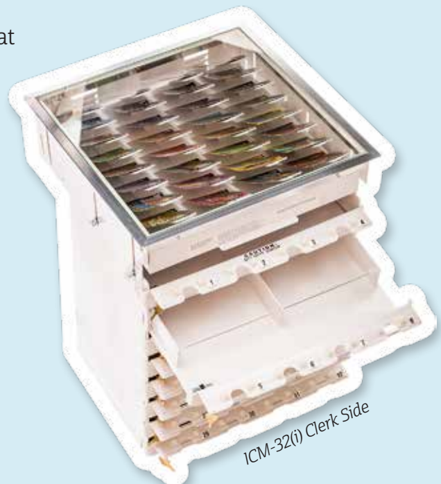
ICM-32(i) Clerk Side