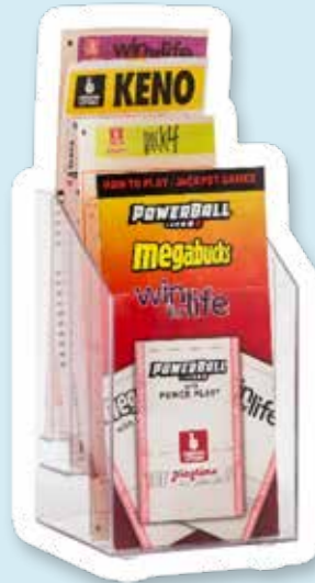
604 4-Pocket also available in 3, 6, 7, 8 and 11-Pocket