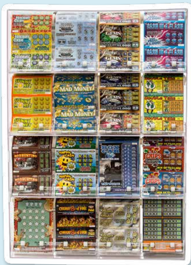
BB-16 16 Game

Perfect for bars, taverns and restaurants or retailers with limited counter space