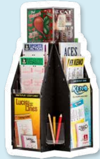
RB-12 12-Pocket RB-8 8-Pocket also available