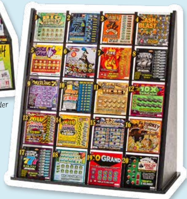
WM-20 20 Game