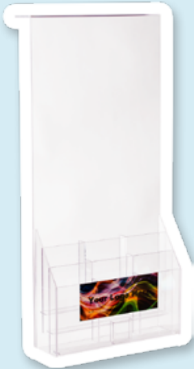
PAT9-pp ITVM 9-Pocket PAT8-pp 8 Pocket also available

Customizable brochure holders display important information