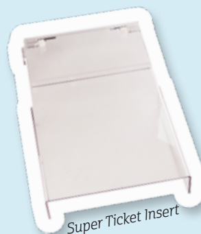
Super Ticket Insert