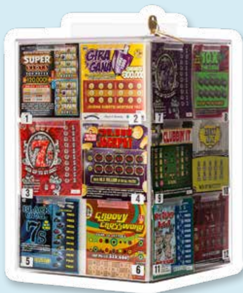
RD-24 Ticket Display

Eye-catching display at the point-of-purchase for retailers with limited counter space. Tickets dispense from a remote location. Also ideal for retailers with multiple selling points!