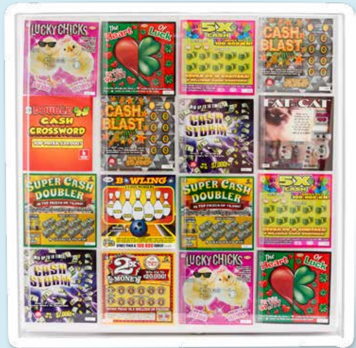
16 Outdoor Game Menu Board