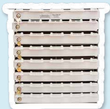
32 Game Remote Base Under Counter